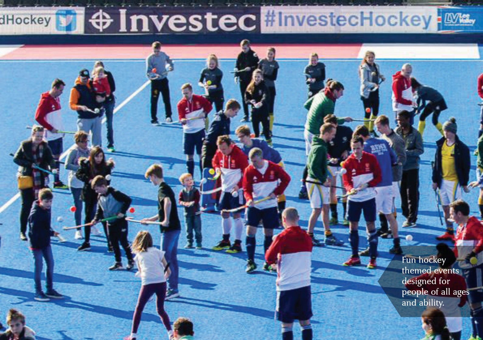
Fun hockey themed events designed for people of all ages and ability.