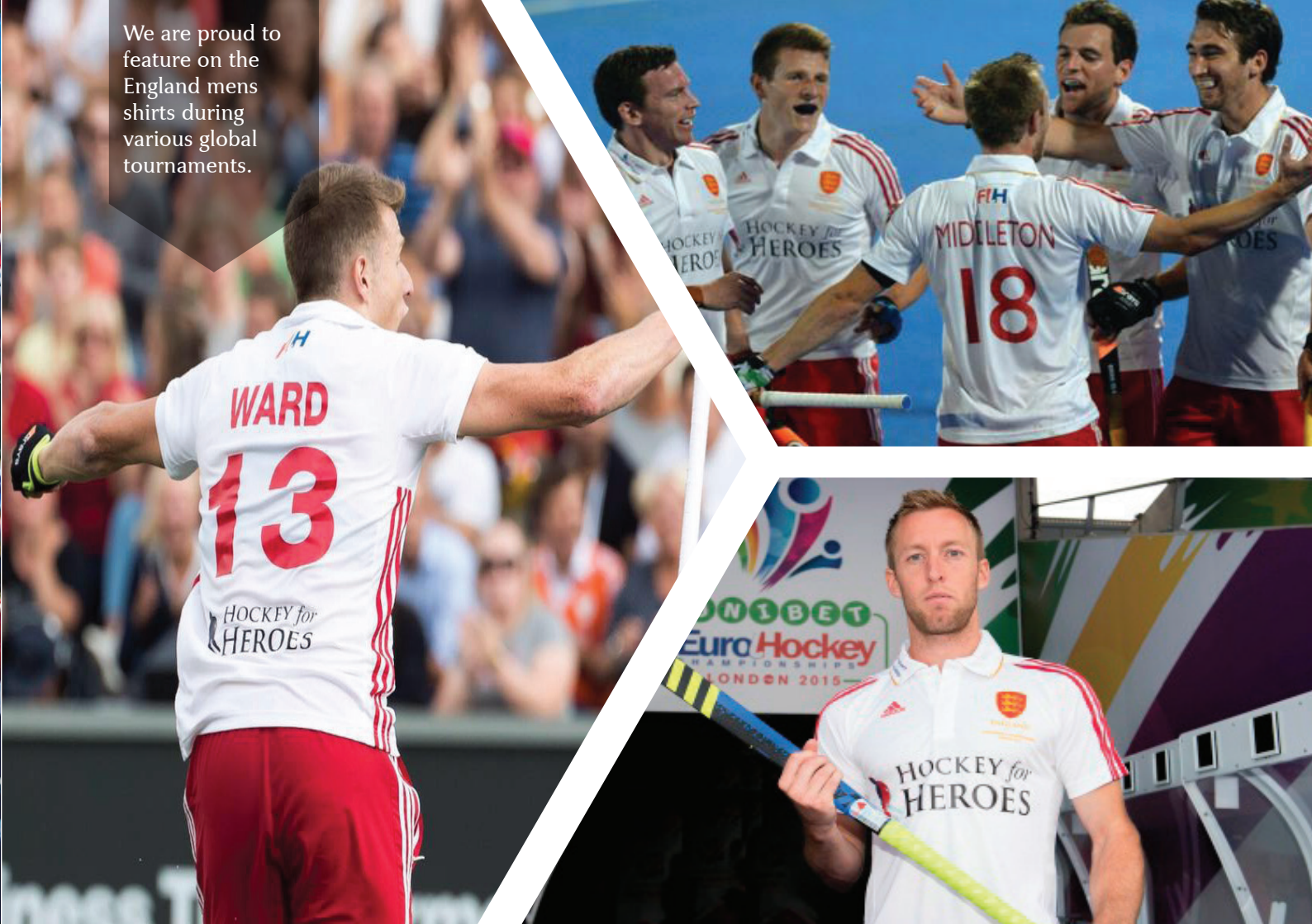
We are proud to feature on the England mens shirts during various global tournaments.